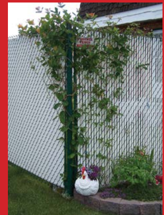
Full Color Green with White Slats