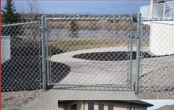
Galvanized Fence with Welded Gate