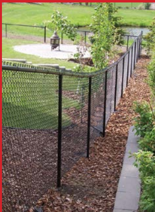
Full Color Black